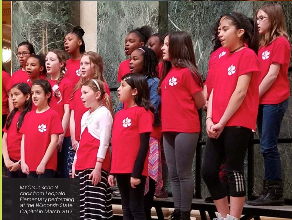
MYC's in-school choir from Leopold Elementary performing at the Wisconsin State Capitol in March 2017.