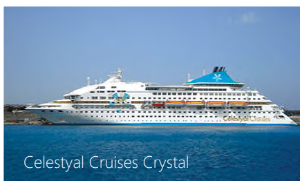
Celestyal Cruises Crystal